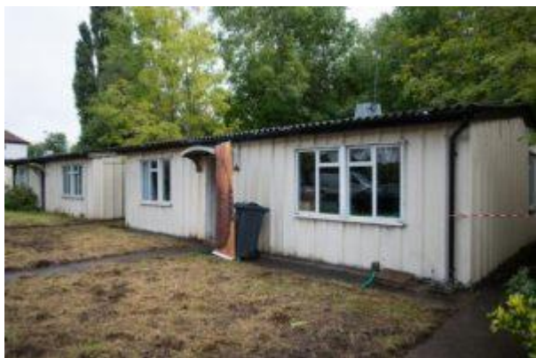
Wake Green Road Prefabs

The Grade II listed Phoenix prefab bungalows in Wake Green Road were designed and manufactured by John Laing, McAlpine and Henry Boot, as part of a consignment of 2,428 prefabs supplied to the Ministry of Works under the Temporary Housing Programme. These temporary homes were only expected to be in use for ten years but 70 years on they are still in use. There are no other known surviving Phoenix prefabs still lived in which makes these extra special.